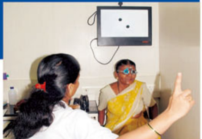
A patient being examined at the vision foundation during the eye check up camp.

Priyadarshni Academy, in collaboration with Vision Foundation of India, organized a highly successful Eye Camp on March 12. One hundred and twenty eight patients were examined in the camp by eye specialists and 30 patients were identified for surgery. These patients will be operated over a period of a month. The operations are sponsored by Priyadarshni Academy.